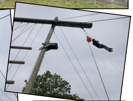
Just a few of the activities on offer