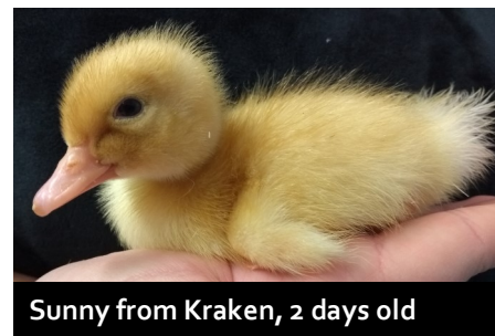
Sunny from Kraken, 2 days old

There has been much egg-citement in Year 4 this week with the arrival of the duckling eggs on Monday. The webcam we have installed has proved very popular allowing the children to watch the ducklings even when we are not in school. The live stream can be accessed weekdays via the tab 'Heathfield Ducks' on our Home Learning Hub: https://sites.google.com/view/heathfield-partnership