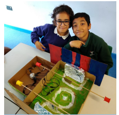
Table Football - Buzzer FC v Light FC