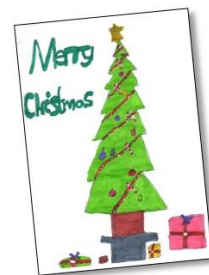
image to be printed onto Christmas cards and other items. Watch this space!

we are continuing our 50/50 Club. Further information about the club was given out today. We are also organising a fireworks dress up day for after half term. Additionally, your child will get the chance to design an