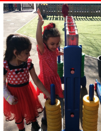
Co-operative Play in Reception on Red Nose Day