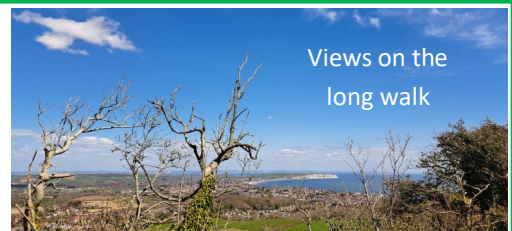
Views on the long walk

The ferry ride was interesting too, we got to see The Needles. Everything was great, it was so worth the money. I had the best time ever!"