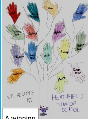
A winning poster

This week has been Children's Mental Health Week. The theme of the week has been 'This is My Place', which is based around how we can feel a sense of belonging and help others feel like they belong. Children in both schools have taken part in assemblies around the theme with Junior children carrying out a belonging based art activity in class. There were also some fantastic entries for our poster competition in Juniors. The Year 5 Mental Health Ambassadors announced the winners last week.