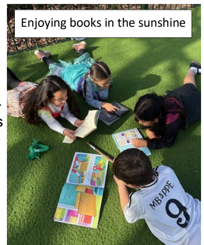
Enjoying books in the sunshine