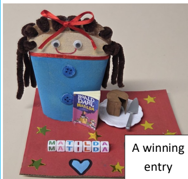
A winning entry