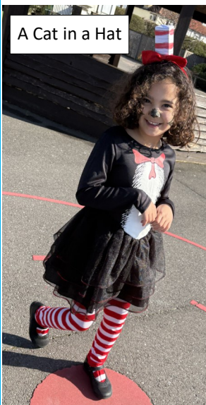
A Cat in a Hat