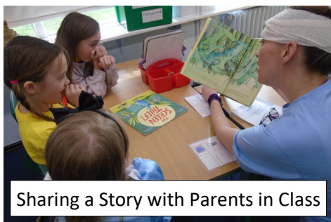
Sharing a Story with Parents in Class

The whole school enjoyed a fabulous day last Thursday 7th March in celebration of World