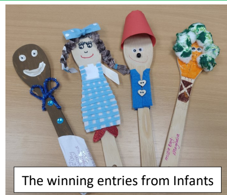
The winning entries from Infants