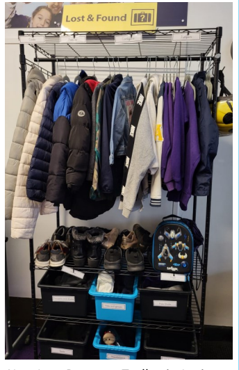
New Lost Property Trolley in Juniors

Please ensure you name all your children's belongings from their water bottles to their shoes and jumpers. Any unnamed lost items will be placed on the Lost Property trolley in the appropriate school. Items left unclaimed after several weeks will either be recycled or donated to a local charity.