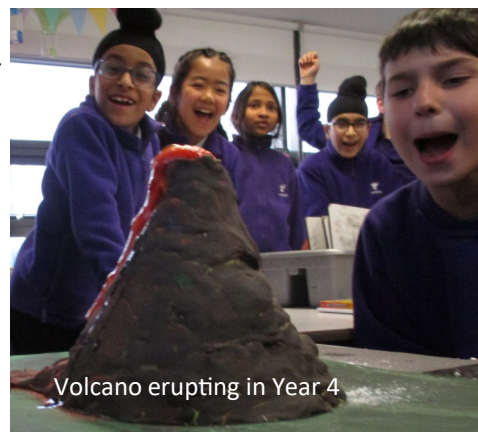
Volcano erupting in Year 4

"It was wonderful to see so many children explaining their impressive homework projects to their parents and carers. It was clear that the children had worked hard on their projects