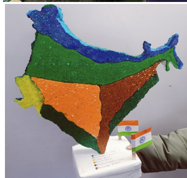
Geography Project Year 5