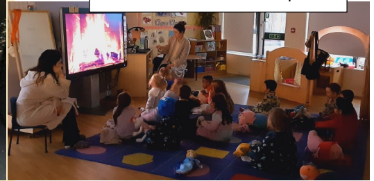
Bedtime Stories in Reception