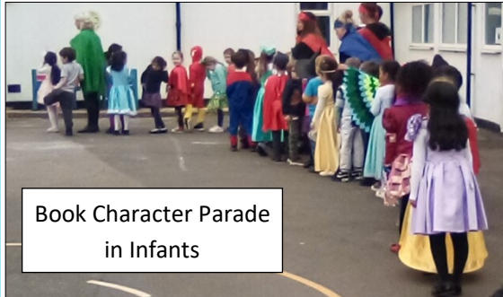
Book Character Parade in Infants

On Friday 3rd March we celebrated World Book Day with both children and staff dressing up as favourite book characters. The day started with parents and carers coming into class to read with their children and continued with a variety of fun activities. The following Thursday children across both schools returned at 5pm in their pyjamas for Bedtime Stories.