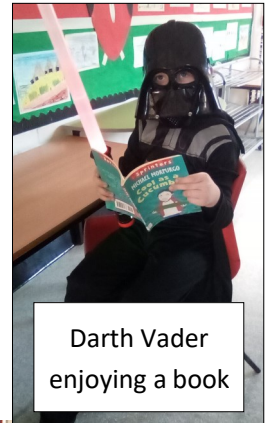
Darth Vader enjoying a book