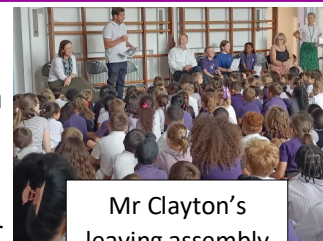
Mr Clayton's leaving assembly