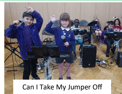
Can I Take My Jumper Off