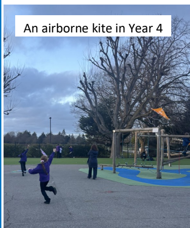
An airborne kite in Year 4

Our Year 4 children were tasked with creating a kite. Maisie explained, "We cut a plastic bag into diamond and triangle shapes and put straws behind them to support it. We could decorate it and add a tail. Once it had a string, we took it outside to fly it."