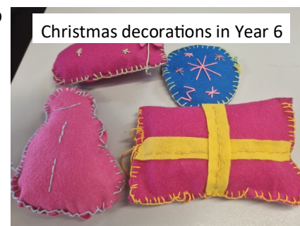
Christmas decorations in Year 6