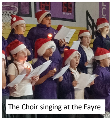
The Choir singing at the Fayre

Last week the PTA continued their busy streak by hosting a Christmas Fayre in the Junior Hall. A huge thank you to the PTA for organising such a wonderful school event which was enjoyed by all who attended.