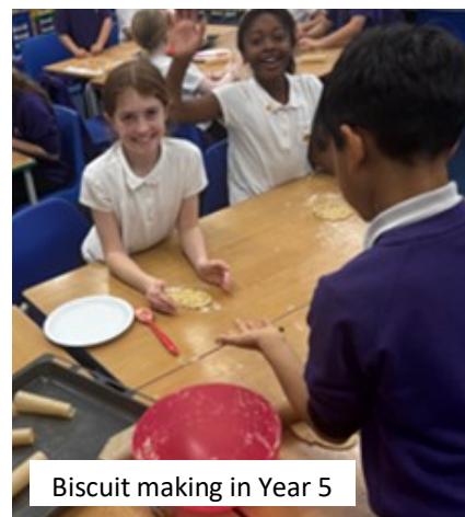
Biscuit making in Year 5

However I think we made ours too chunky so we only got one each! Other than that they were delicious."