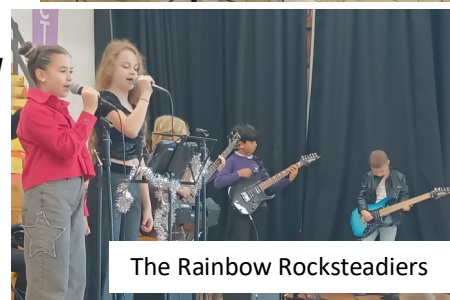
The Rainbow Rocksteadiers