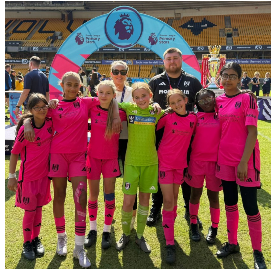
Team photo with the Premier League trophy