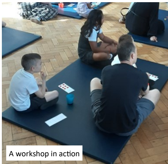
A workshop in action