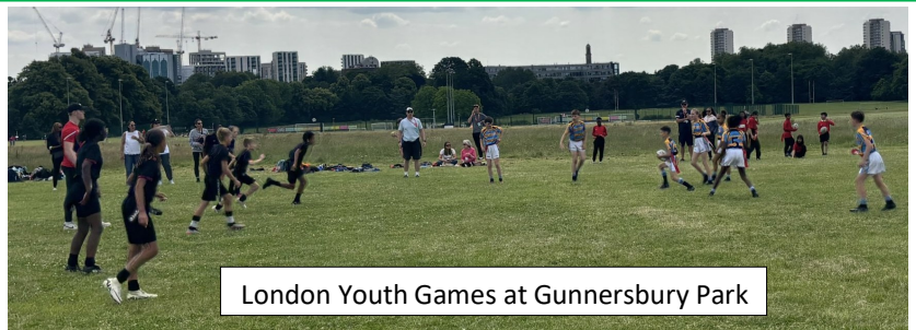
London Youth Games at Gunnersbury Park

On Tuesday 18th June, our tag rugby team represented Richmond Borough in the London Youth Games. The children played against the leading schools from other London boroughs. The team played nine games in total, winning 6, drawing 1 and losing 2 - an extraordinary achievement.