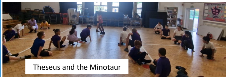
Theseus and the Minotaur