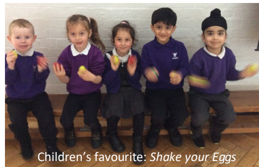
Children's favourite: Shake your Eggs