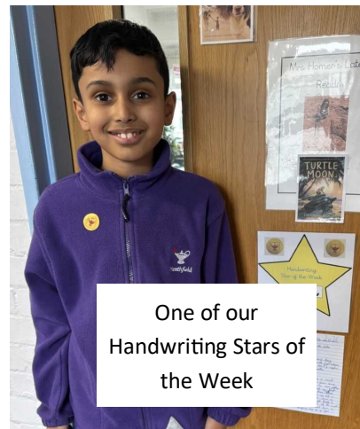
One of our Handwriting Stars of the Week

Handwriting is a focus this year across both schools. This term we are working on ensuring the beautiful handwriting that we see in handwriting lessons is transferred to every lesson, from English books to writing in science and history. Children who show an improvement in their handwriting or their best handwriting in a lesson are awarded the 'Handwriting Star of the Week'. Their handwriting is displayed on the classroom door for everyone to admire. In Infants Handwriting Stars are given a special pencil while in Juniors they are awarded an AAB sticker (Above And Beyond) which is worth 3 house points.