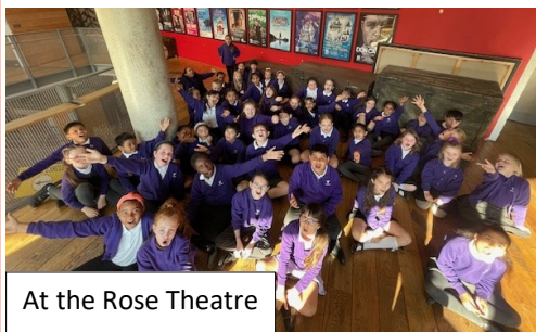
At the Rose Theatre