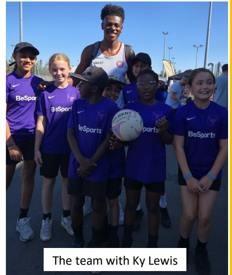
The team with Ky Lewis

Unfortunately, the team then conceded first in golden net. Mr Nuthall was delighted saying, "Being in the top four schools in London is a massive achievement and meant they all received bronze medals. It is especially impressive considering that all but one of the children were new to netball in September. The team were also fortunate enough to meet and be umpired by England's shooter Ky Lewis."