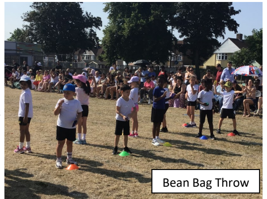
Bean Bag Throw