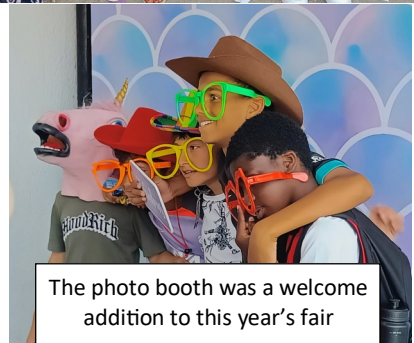
The photo booth was a welcome addition to this year's fair