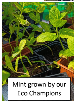
Mint grown by our Eco Champions