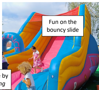
Fun on the bouncy slide