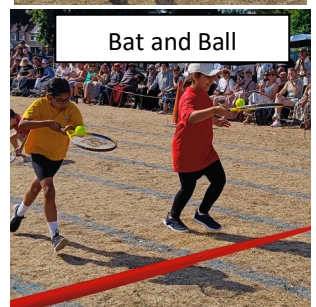
Bat and Ball