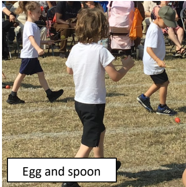
Egg and spoon

The Infants had a brilliant morning at Sports Day last Thursday. Years 1 and 2 started off the morning with bean bag throwing followed by egg and spoon races, hurdles and running races.