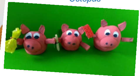
Three Little Pigs by Lyla Scylla