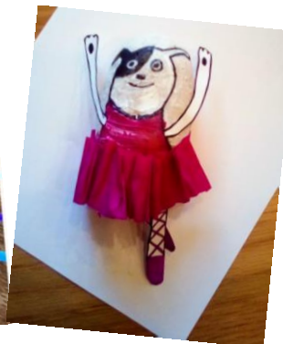
Biff by Eliza Twilight