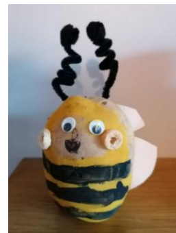
Bumblebear by Maisie Octopus

Once again, our children excelled themselves for this year's Potato Competition. Our entries have been submitted and we should receive the results next week. Here are some of our amazing entries: