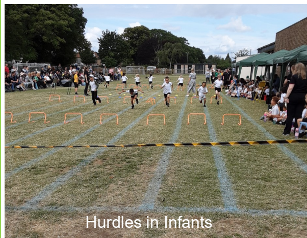
Hurdles in Infants

Last week our Junior children took part in their Sports Day and yesterday it was the turn of the Infants. There was a great turnout of parents and carers at both events to cheer the children on and everyone enjoyed the family picnic which took place at lunchtime on each day. Infants took part in running races, hurdles, bean bag shot put and egg