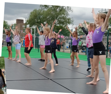
Lively performances from our choir and gymnasts