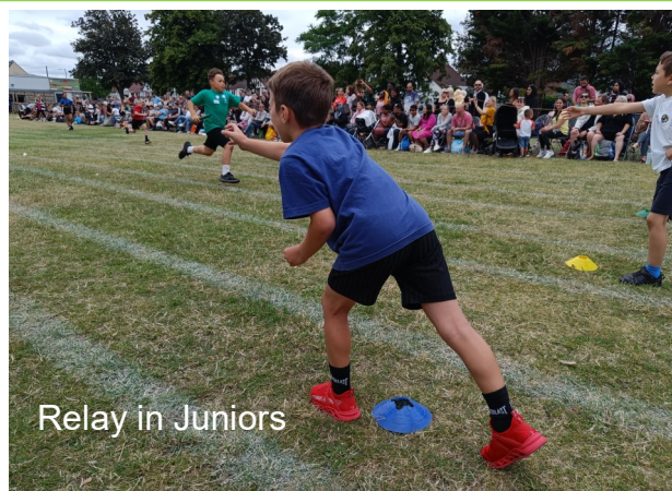
Relay in Juniors

and spoon races and were incredibly enthusiastic throughout.