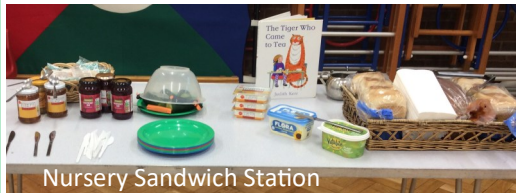
Nursery Sandwich Station

Thank you to all our parents and carers who have attended one of our reading workshops in the Infant School over the last few weeks. Nursery children and their adults had a wonderful time making sandwiches and wraps for their Tiger Who Came Tea party. Reception's workshop centred on making gingerbread while Year 1 parents helped their children to make beautiful rainbow magnets, which linked to their work on poetry. Year 2 focused on being super spellers. In all the workshops, we talked about the importance of reading to our children at home, tuning them into sounds through sound games and nursery rhymes as well as helping the children with their own reading.