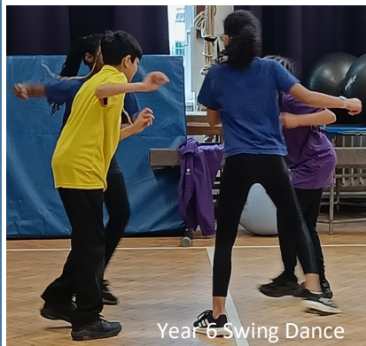
Year 6 Swing Dance