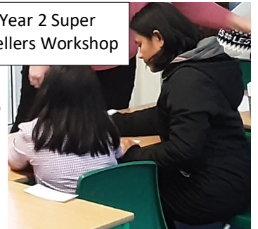
Year 2 Super Spellers Workshop