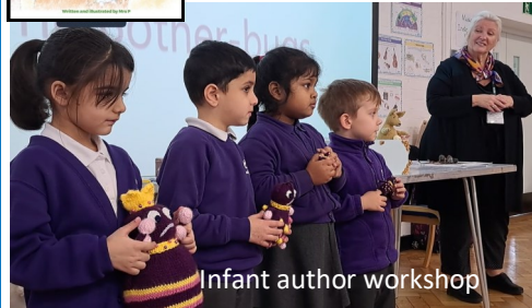
Infant author workshop