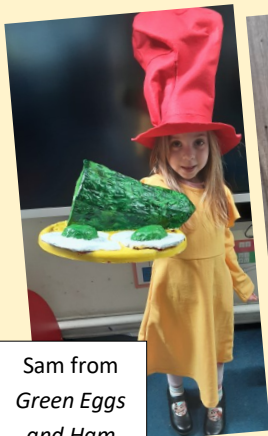
Sam from Green Eggs and Ham