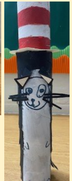
Cat in the Hat