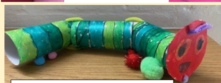
The Very Hungry Caterpillar