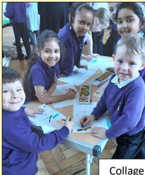
Collage in progress