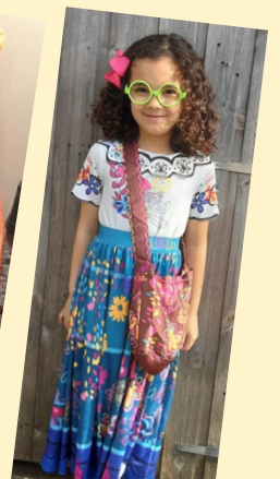
Mirabel from Encanto