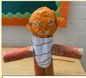
The Tiger who Came to Tea