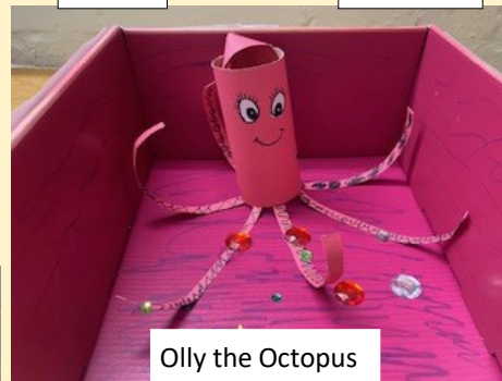
Olly the Octopus