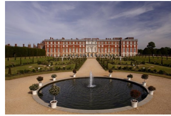
Hampton Court Palace