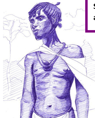
Drawing: using pens to draw bodies

Sculpture: making paper and cardboard maquettes