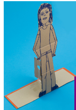
Sculpture: using a wire frame and clay

Sculpture: making paper and cardboard maquettes