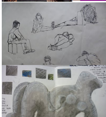
Drawing: using tone and line to draw bodies