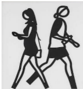
Observational drawings: using felt tip to draw bodies

Fashion designer: A person that draws and makes clothing and accessories based on new styles