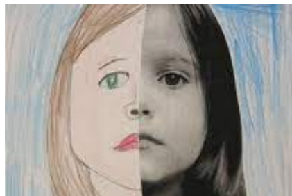
Drawing: Use tone

Create a portrait that combines skills style to represent you