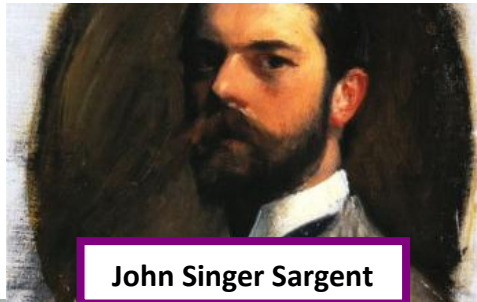
John Singer Sargent

This Art unit follows on from previous studies in year 4. This unit will deepen the children's understanding of how to use different pencils, photographs, paintings to create quality art work that shows progression in their skills. The children will also about a range of great artists, designers and photographers and recognise features of their work. Sketchbooks will be used to collect, develop, test ideas and learn from their mistakes. They will show a growing confidence to discuss the features of their own and others work, expressing thoughts and feelings. They will become more reflective about choosing materials and colours to achieve specific effects