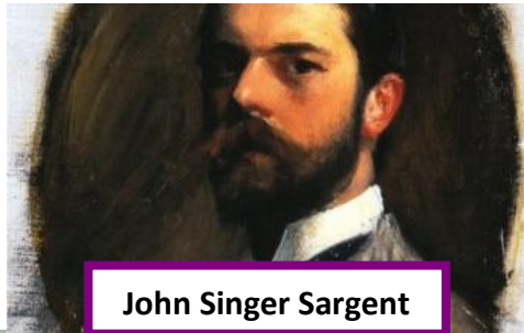
John Singer Sargent

This Art unit follows on from previous studies in year 4. This unit will deepen the children's understanding of how to use different pencils, photographs, paintings to create quality art work that shows progression in their skills. The children will also about a range of great artists, designers and photographers and recognise features of their work. Sketchbooks will be used to collect, develop, test ideas and learn from their mistakes. They will show a growing confidence to discuss the features of their own and others work, expressing thoughts and feelings. They will become more reflective about choosing materials and colours to achieve specific effects