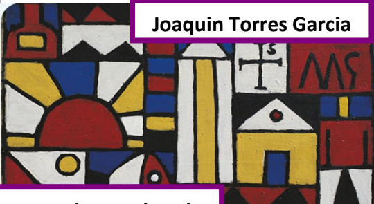
Famous Artists explored