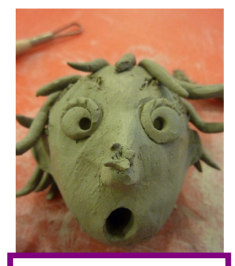
Sculpture: Use clay and tools to create a head that shows emotion and expression.