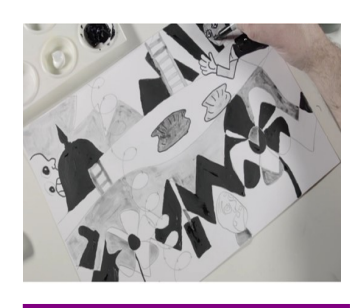
Painting: Use black and white paint to make tones of grey to paint Picasso inspired picture