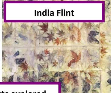
Famous Artists explored